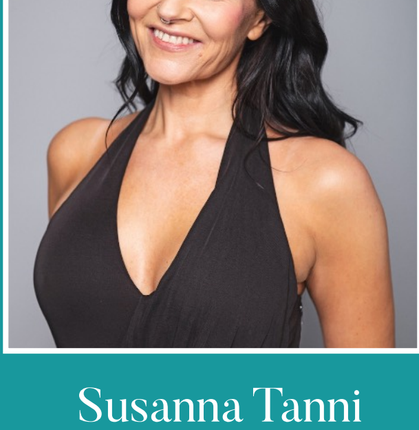
Institute of Happiness, Founder TraumaNeuro Coaching, Founder